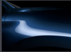
Gun Blue Metallic