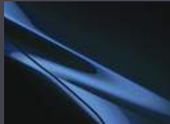
Deep Crystal Blue