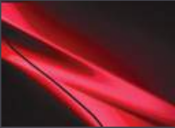
Soul Red Crystal