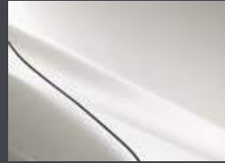
Snowflake White Pearl